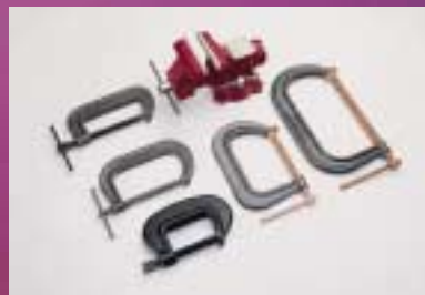
Clamps & Vises