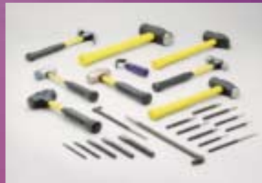
Hammers, Punches & Chisels