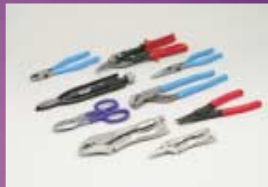
Pliers, Snips & Scissors