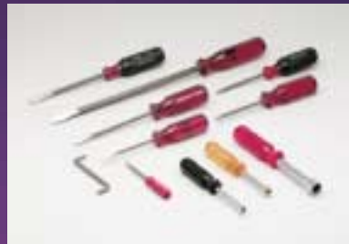
Screwdrivers & Nut Drivers