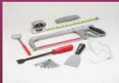
Miscellaneous Tools & Accessories